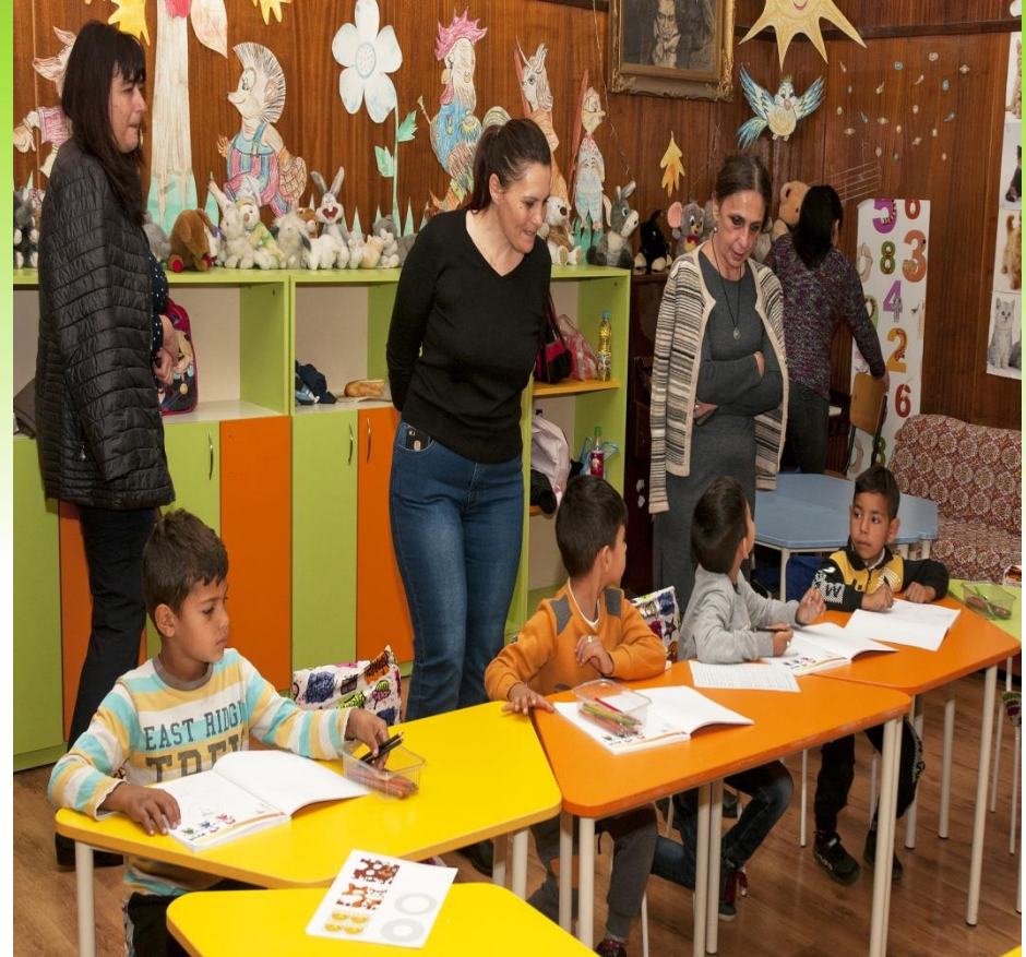
Third grade visit and preparatory group